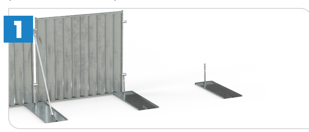
Lay the hoarding panels along the perimeter line.Position the block trays next to the edge of each steel panel, so that you have your panels and block trays in the right position, ready for the hoarding to be attached.