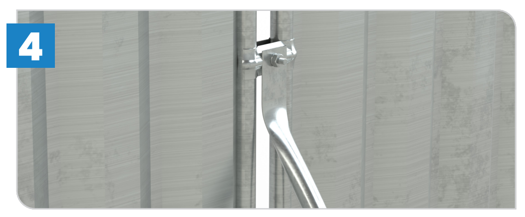
The other end of the stabiliser arm is attached to the top section of each hoarding panel using a coupler. Put the coupler in place and secure the end of the stabilizer arm using the screw and bolt. Screw the other end of the stabilizer arm down into the block tray.