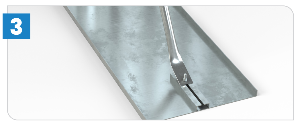
Attach one end of the stabilizer arm to the bottom of the block tray at roughly a 60-degree angle.

The block trays have a channel at the front. The steel panel is inserted into the channel. Don't secure the hinge in the block tray just yet, this can be done once the stabilizer arm is in place.